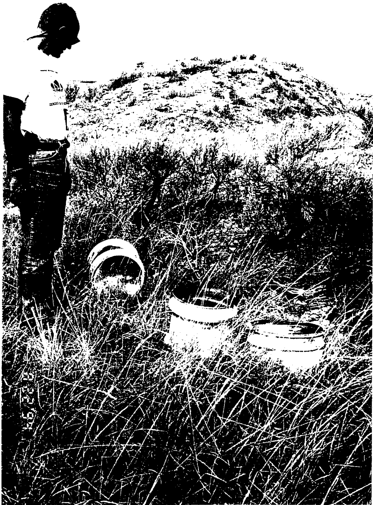
MISC-45, Dirt Pile With Naval Smoke Cans Near INTEC