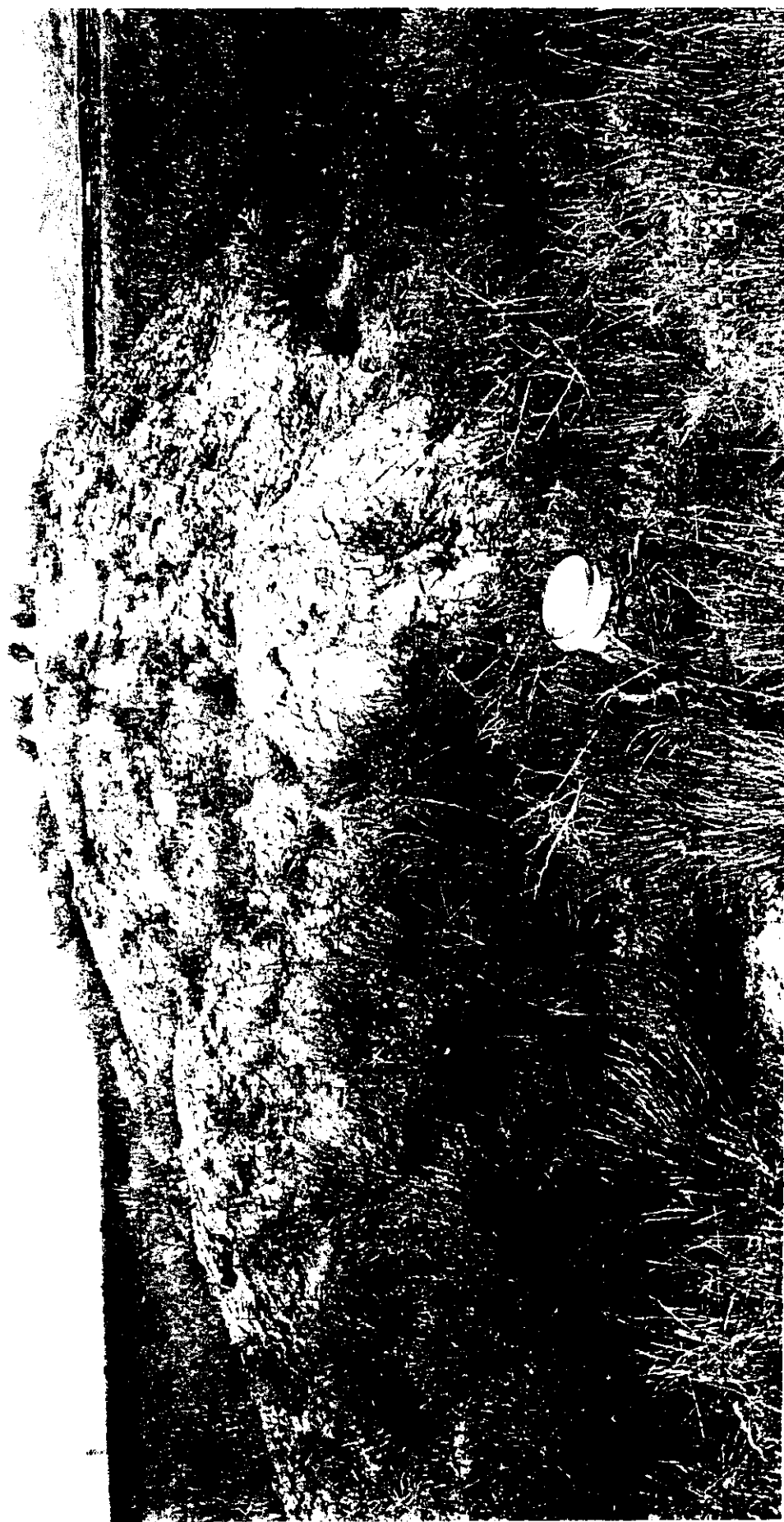
MISC-45, Dirt Pile with Naval Smoke Cans Near INTEC