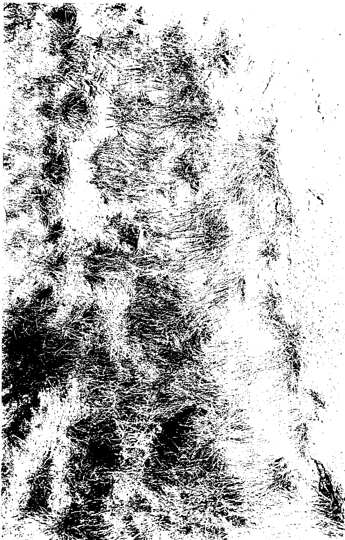
MISC-27, Mound Near East Portland/East Ogden Intersection