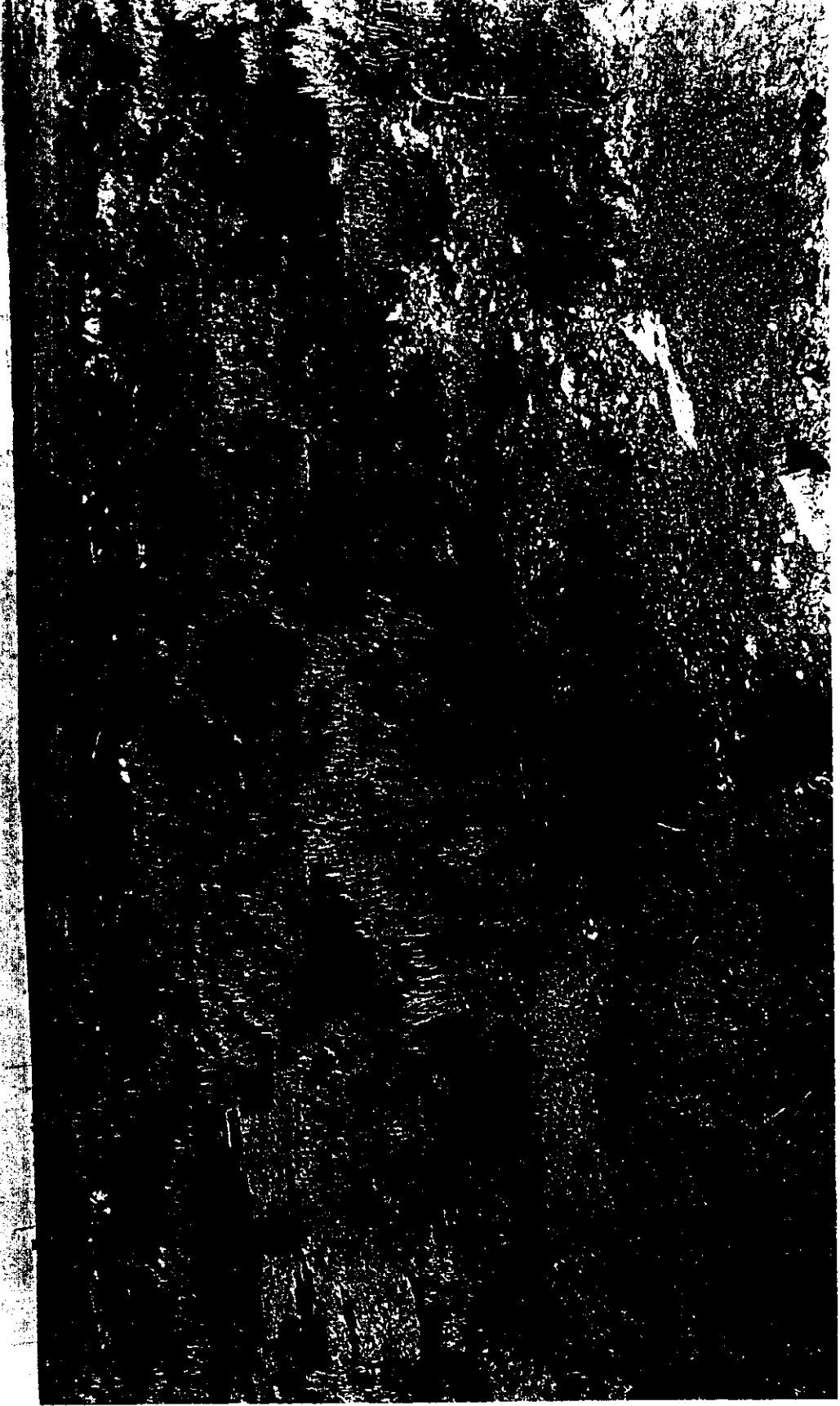
MISC-26, Detonation Pit Between NRF and TRA