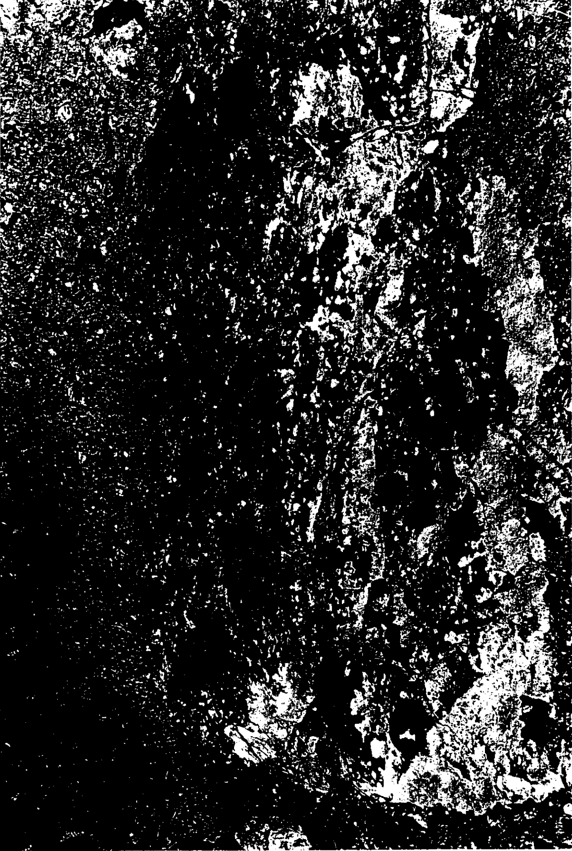
MISC-26, Detonation Pit Between NRF and TRA