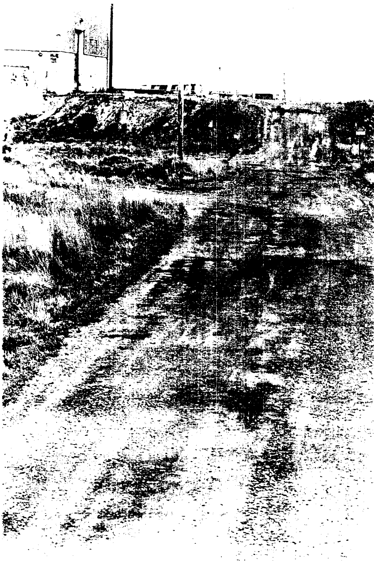
MISC-21, Staining on Road 17 from STF to Portland Road