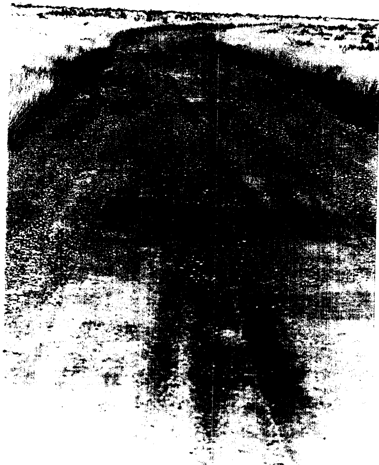
MISC-21, Staining on Road 17 from STF to Portland Road