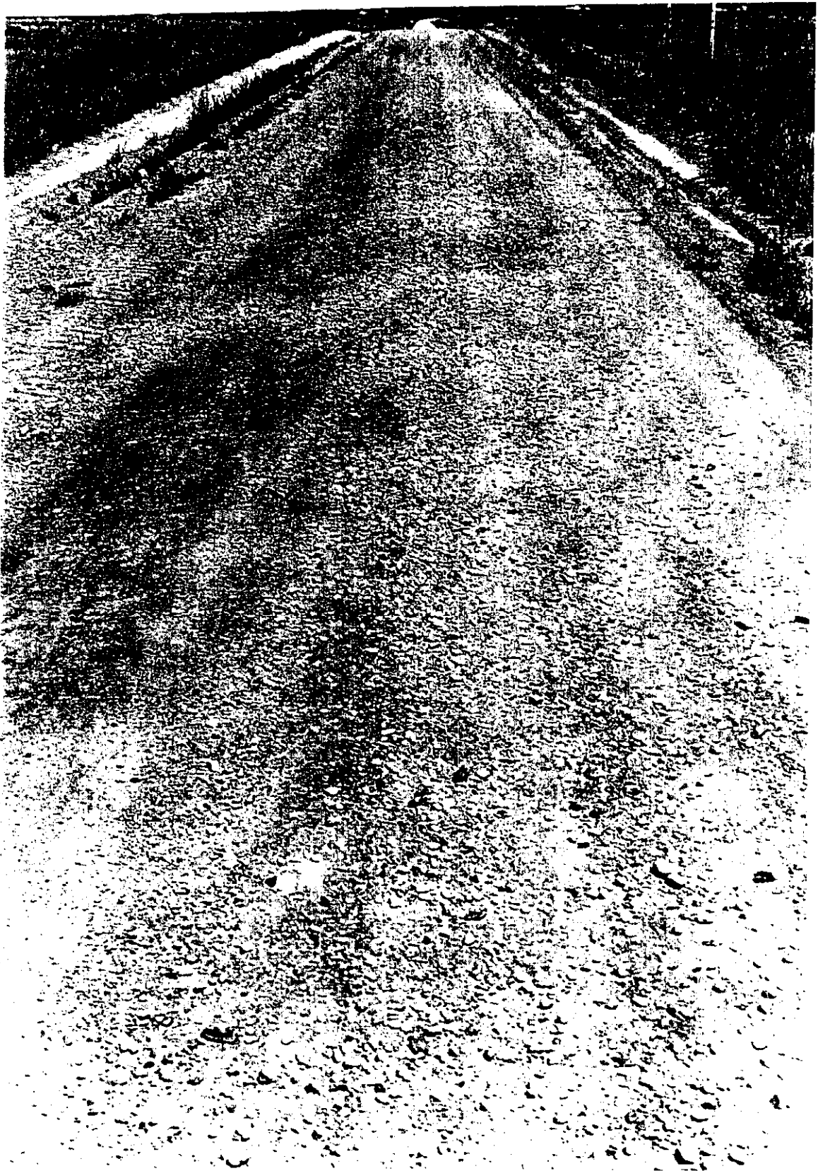
MISC-21, Staining on Road 17 from STF to Porland Road