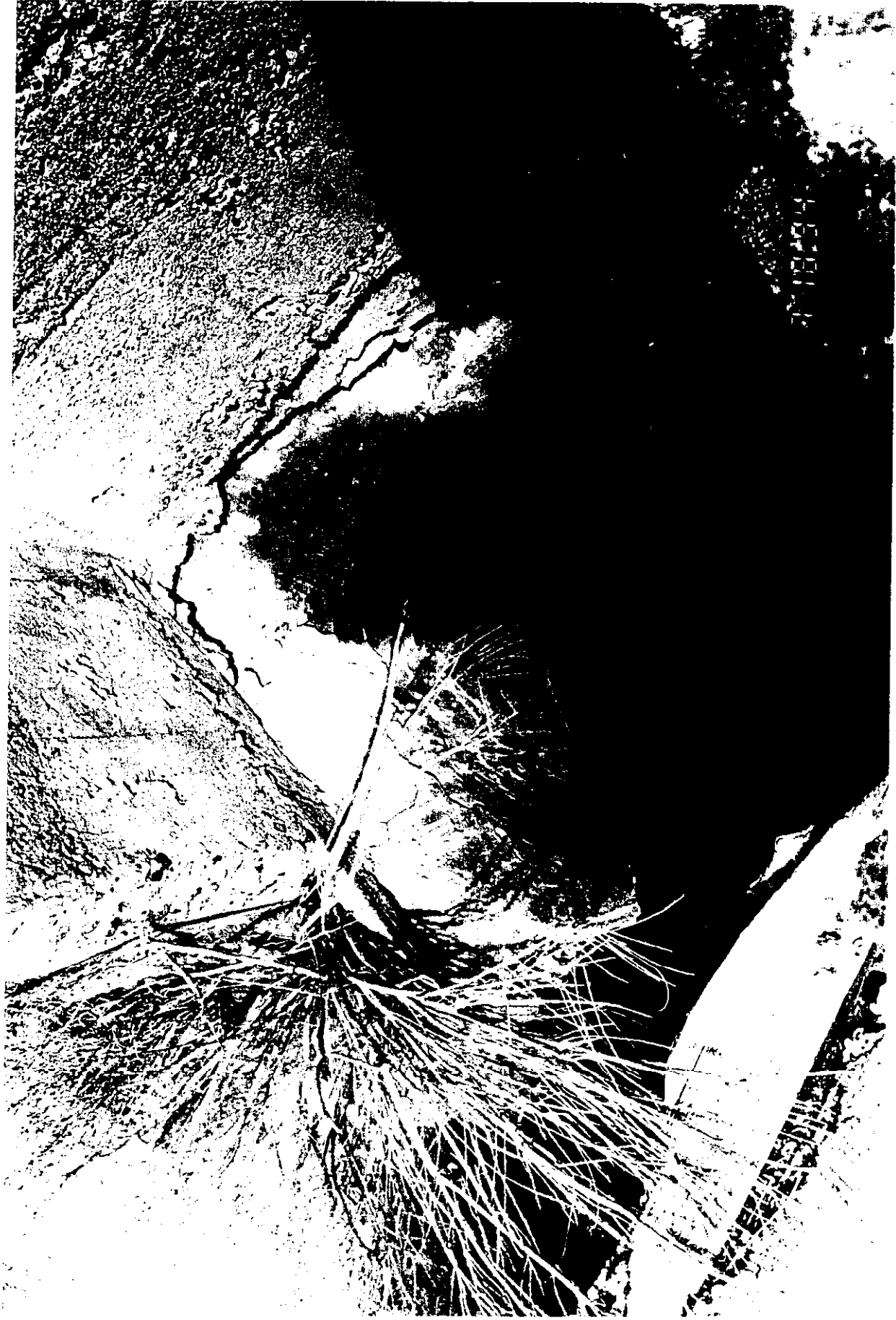
MISC-06, Cistern North of NRF