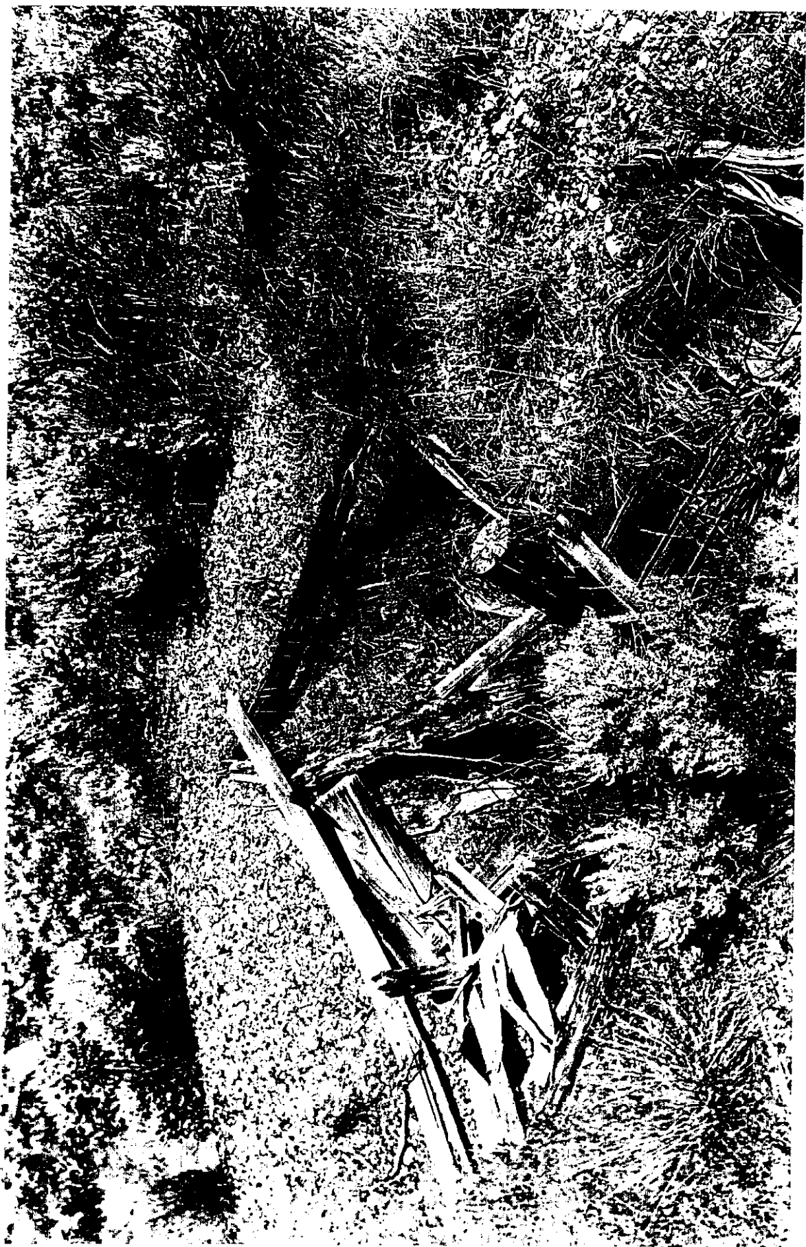
MISC-05, Excavation Pit/Mound and Debris East of Guard Gate 3