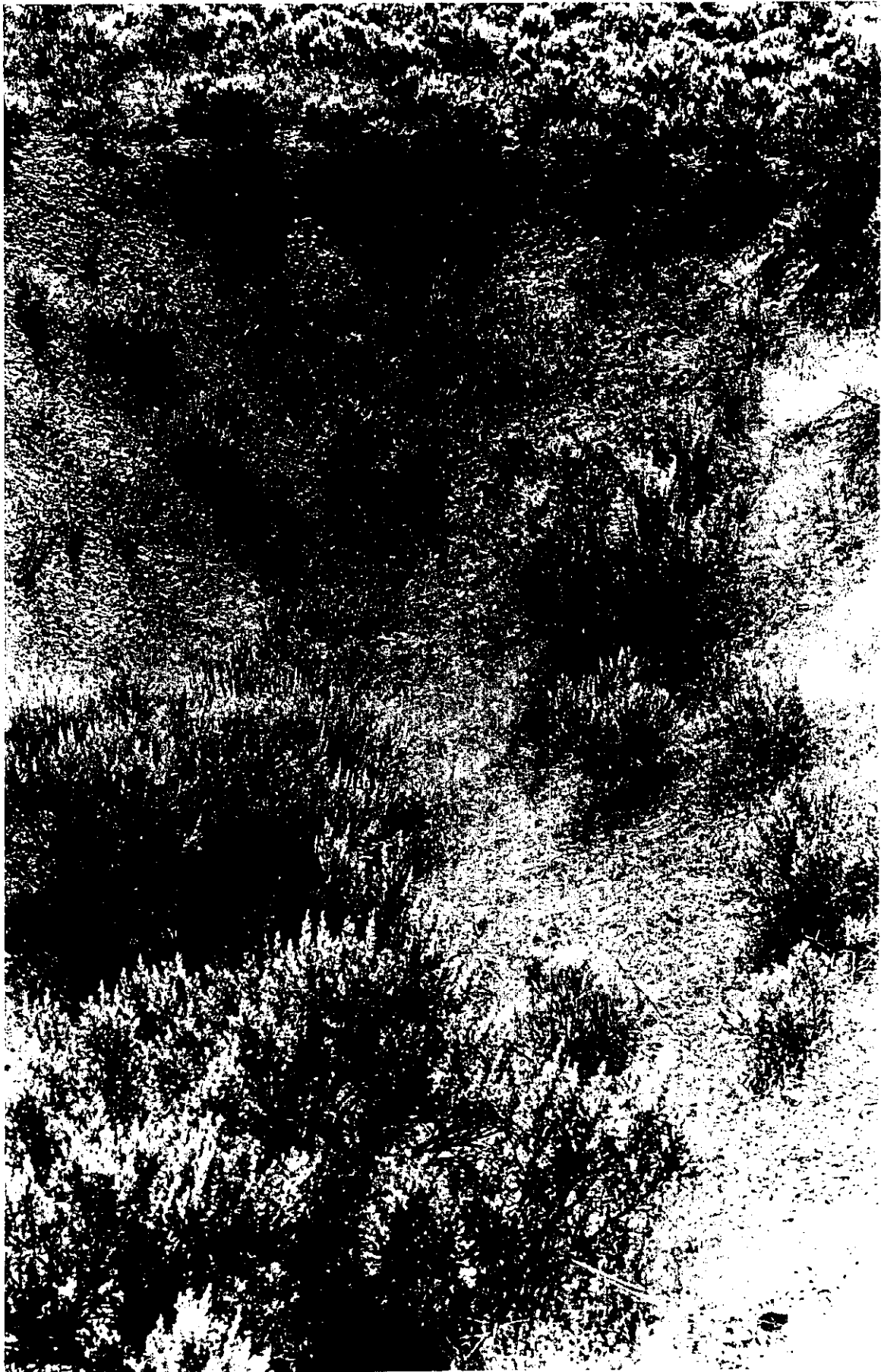
MISC-05, Excavation Pit/Mound and Debris East of Guard Gate 3