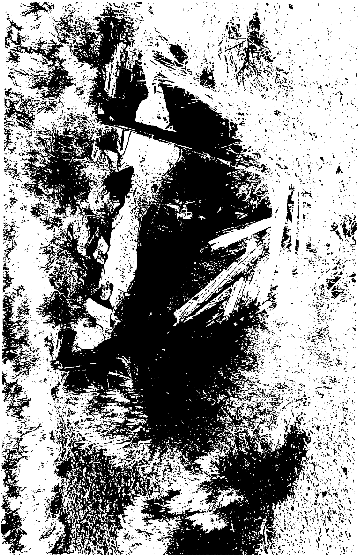
MISC-05, Excavation Pit/Mound and Debris East of Guard Gate 3