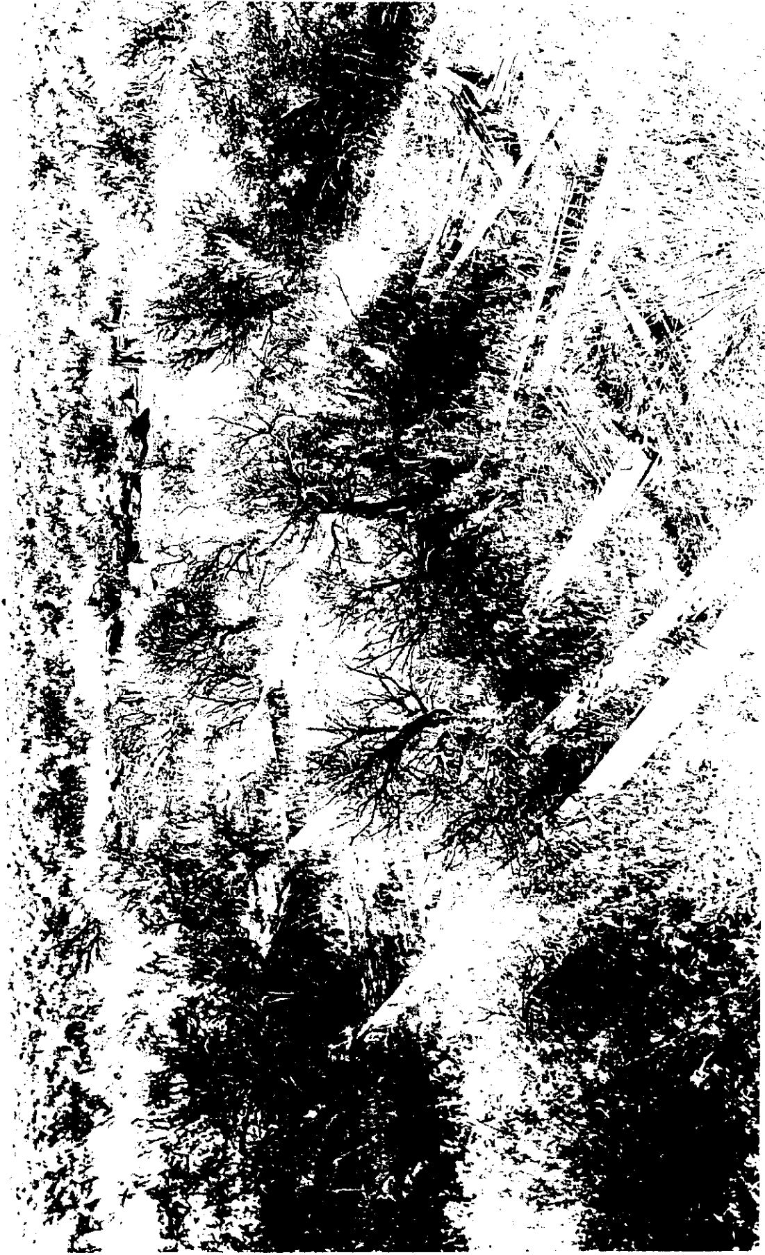
MISC-05, Excavation Pit/Mound and Debris East of Guard Gate 3