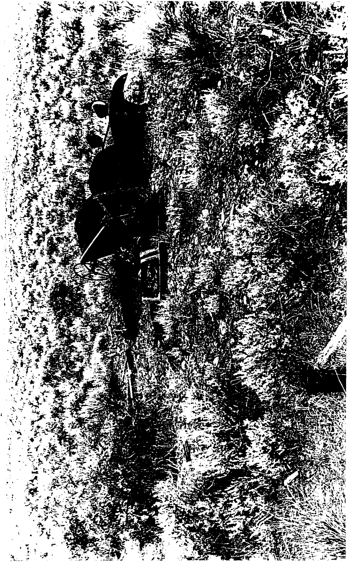
MISC-03, Car Body Adjacent to Big Lost River