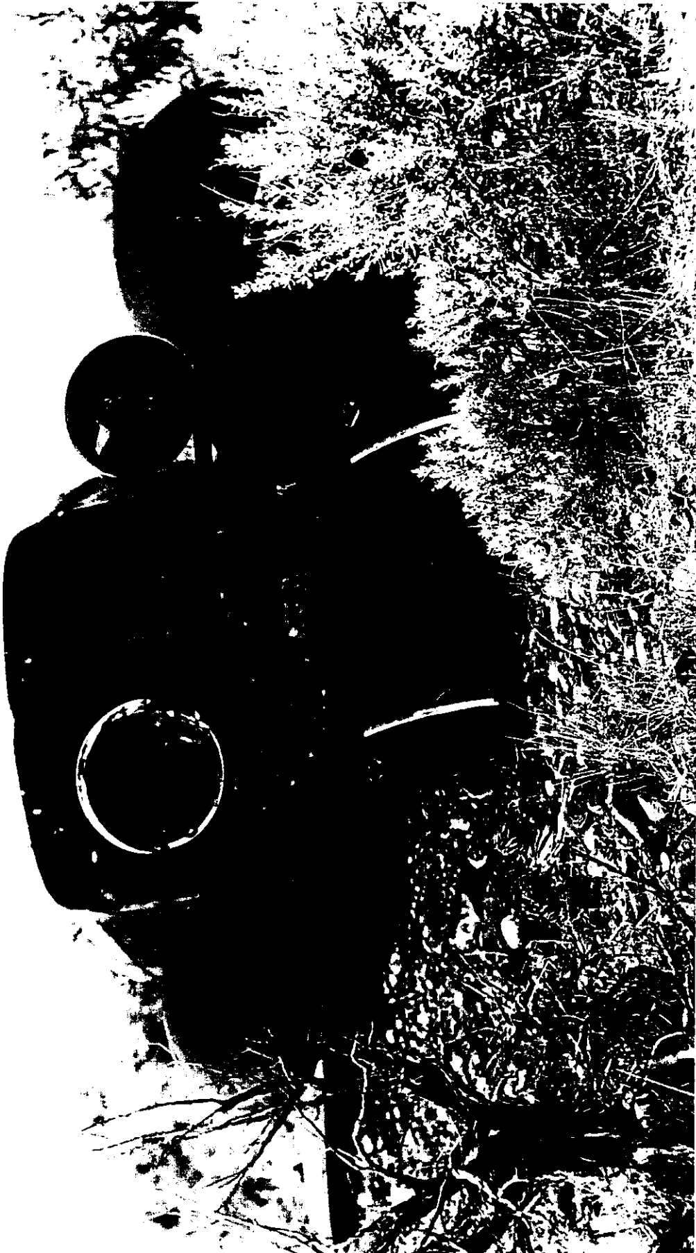
MISC-03, Car Body Adjacent to Big Lost River